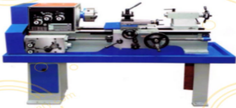
LITE DUTY ALL GEAR LATHE MACHINE UPTO 40MM