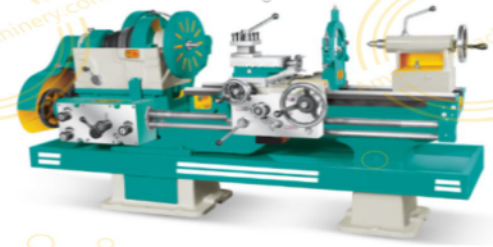
HEAVY DUTY PRECISION LATHE MACHINE UPTO 205MM